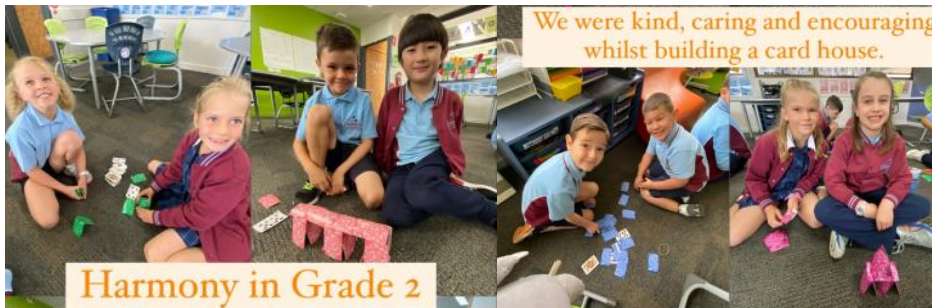
Harmony in Grade 2

Grade 2 students have been exploring Harmony all week through varied learning experiences such as making a card house, drawing a Zentangle and reflecting on what we are grateful for. We have agreed to continue to celebrate our unique differences, treat others with kindness and be honest and helpful. We will be mindful, show gratitude and allow time to be quiet and peaceful.