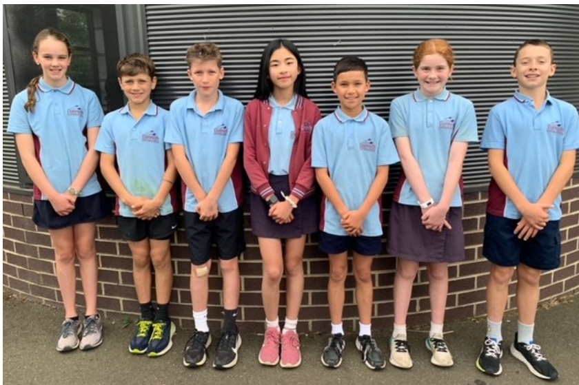
2024 House Captains

A round of applause to the 2024 Student Leaders taking on these new roles. We wish you all the very best and a rewarding year ahead.